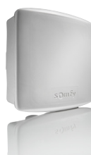
Lighting Receiver RTS

The remote handset for general garage door operation.