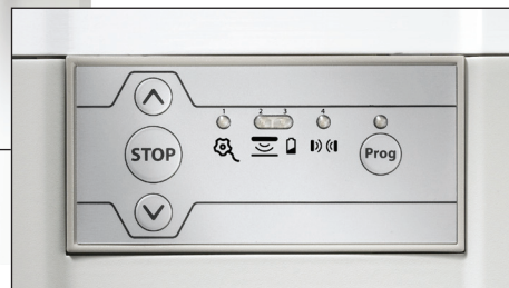
Control buttons and LED diagnostic interface on the front panel.